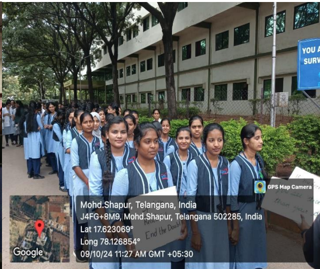
09/10/24 11:27 AM GMT +05:30 Mohd.Shapur, Telangana, India J4FG+8M9, Mohd.Shapur, Telangana 502285, India Lat 17.623069° Long 78.126854° Google