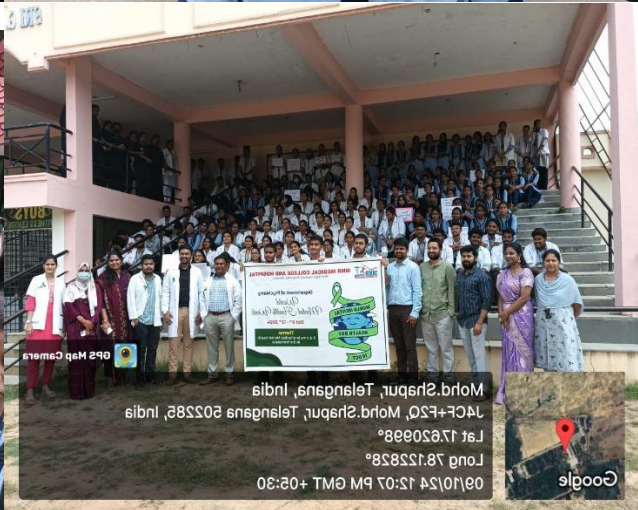
09/10/24 12:02 PM GMT +05:30 Mohd.Shapur, Telangana, India J4FC+72Q, Mohd.Shapur, Telangana 502285, India Lat 17.620988° Long 78.125258° Google