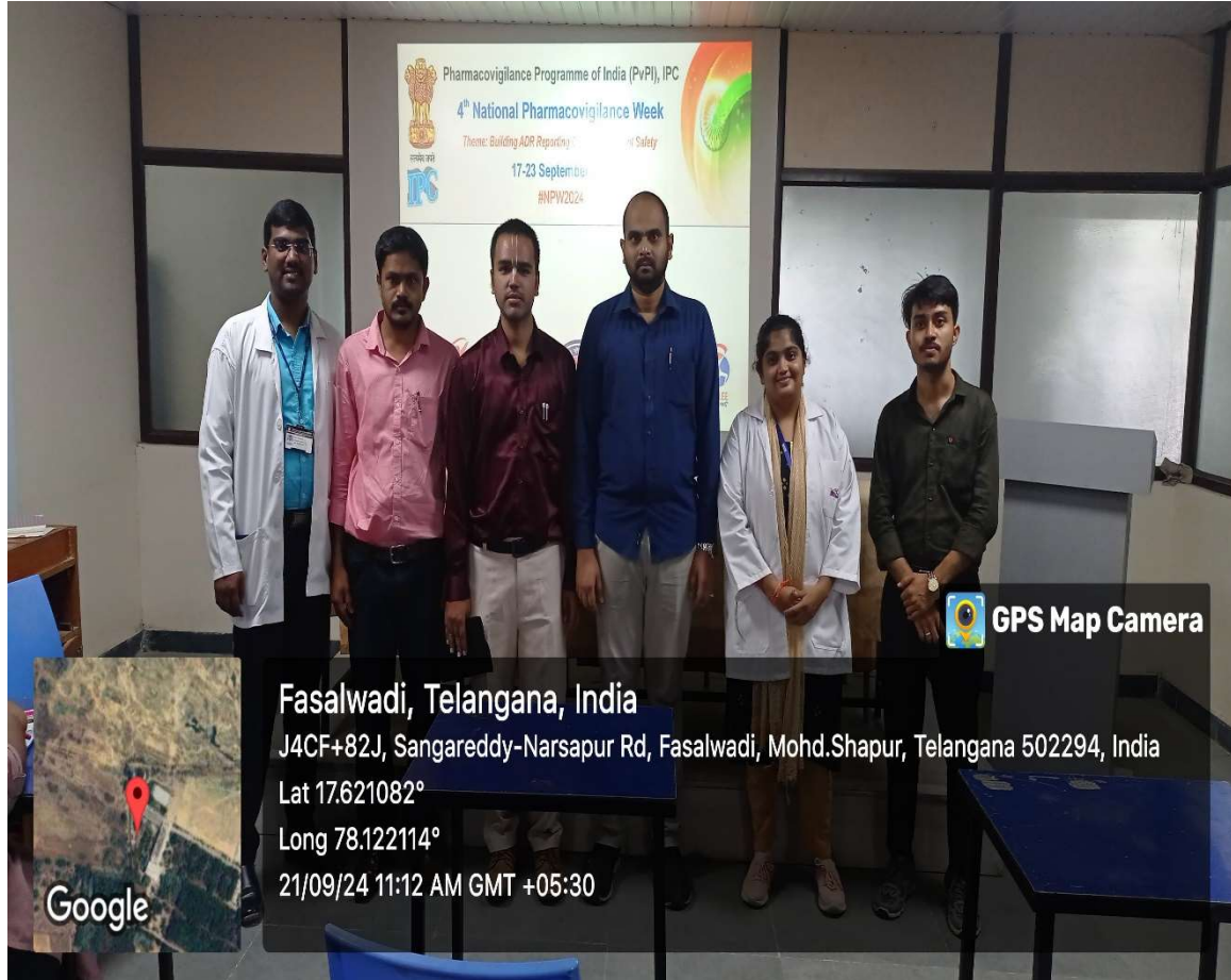
4 th National Pharmacovigilance week Sensitization cum awareness program on 21/09/2024 at MNR Sanjeevani College of Physiotherapy.